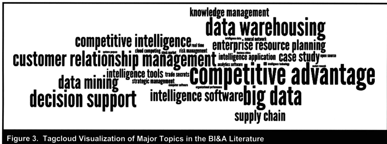
Figure 3. Tagcloud Visualization of Major Topics in the BI&A Literature

intelligence, enterprise resource planning, and knowledge management were also highly ranked. Overall, the topics extracted were highly relevant to BI&A, especially for its managerial and application values, although most of the detailed technical terms, as described in the previous research framework sections, were not present. This could be attributed to the tendency of authors to use broad terminologies in article titles and abstracts.